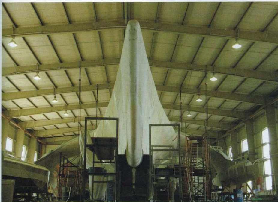
The 138 trimaran in the yard.

Some of these projects defy the view of McConaghy's solely a race boat builder. At the time of Asia-Pacific Boating's visit, there were two hovercraft in production, one nearly done. These are normally purchased for mass tourism or military uses, but sport coupe versions with