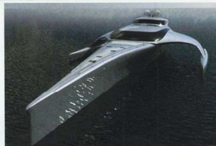
McConaghy's sleek 138-foot trimaran will soon be cruising the Philippines and Hong Kong.

convertible hard top can be developed for more personal use. McConaghy's estimates top speeds at about 100 miles per hour.